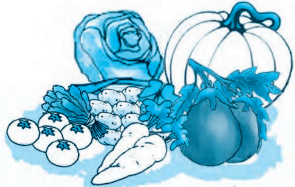
Fig. 1.2 : Healthy Diet

One must do 20–30 minutes of physical activity daily to keep fit. This can be done by taking part in sports. Exercising or spot jogging can be done at home. Simple walking, climbing stairs, not using the lift and skipping have the same effect. Gym is another dedicated place for workouts.